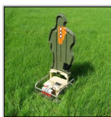
Stationary Infantry Target (SIT) Type 282 - Type 287