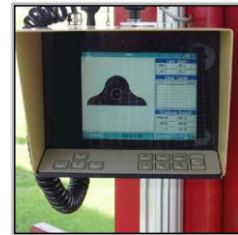
Shooters Monitor Type 292-001