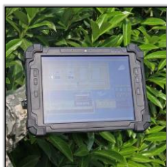
Mobile Tablet PC Type 274-001