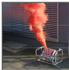
Battle Effects Simulator (BATES) Type 220-221