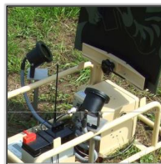
Muzzle Flash Simulator Type 223-001