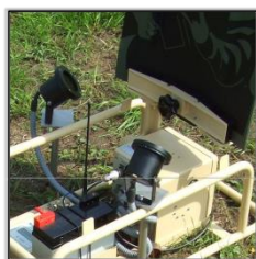
Muzzle Flash Simulator Type 223-001