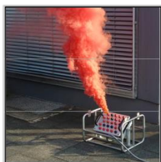
Battle Effects Simulator (BATES) Type 220-221