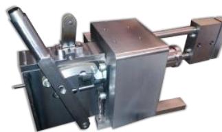
Universal Receiver Type 681-1000