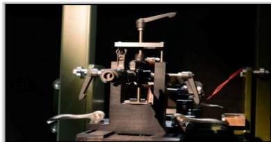
Universal Weapon Rest Type 681-600