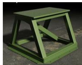
Stand Type 681-550