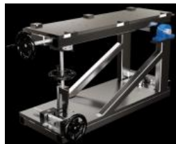
Azimuth/Elevation mount Type 681-400