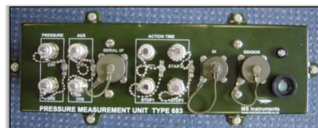
Pressure Measurement Unit Type 683