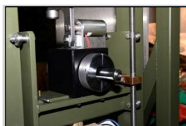
Universal Receiver Type 681-700