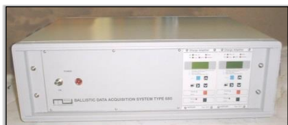
Ballistic Data Acquisition System Type 680