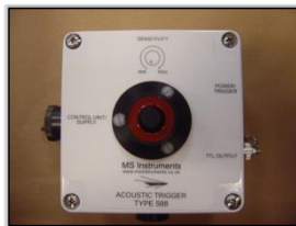
Acoustic Detector Type 588