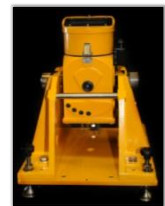
Optical Detector Type 858