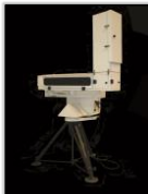
Automated Flight Follower Type 631