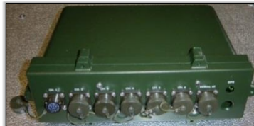
Triple-Channel Remote Unit Type 817