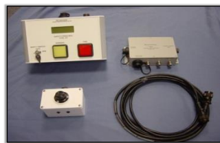
Safety Firing System Type 157